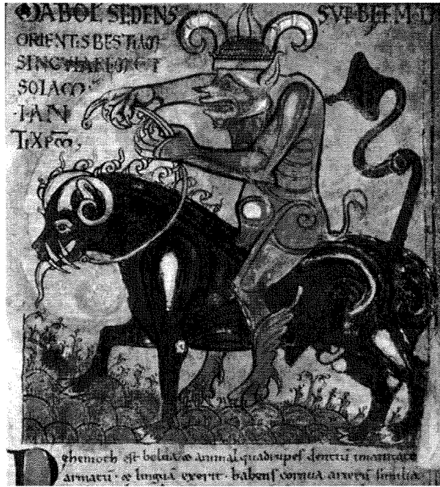
Fig. 6: Devil seated on Behemoth , from the Liber Floridus , autograph of Lambert of St. Omer. Ghent, Bibliothèque de l'Université, Ms. 92, fol. 62r

He made several worlds before ours, but He destroyed them all, because He was pleased with none until He created ours. 33 Only a view including Jewish and Christian culture and thought could reveal the identity of the primordial creature in the middle of the first panel. The Behemoth is placed at the center, like a last relic of the former world. 34 The beast had contributed significantly to the primordial chaos and is now contributing to the moment shown here: the creation of the new world.