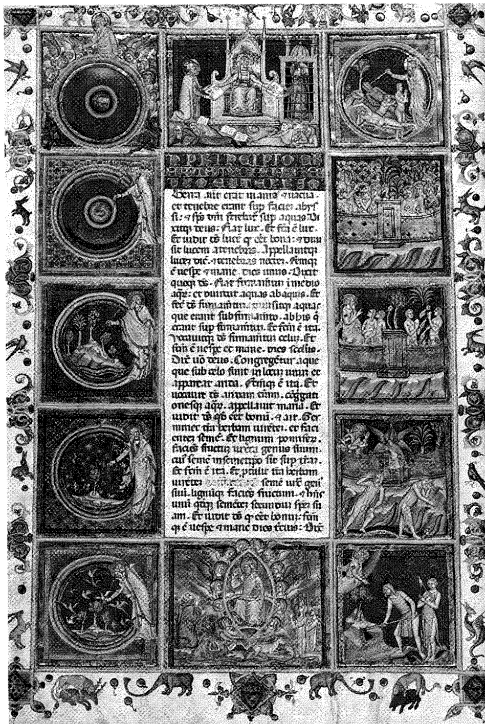
Fig. 2: Bible for Matteo de Planisio, Naples, 1352 or later (?). Vatican, Biblioteca Apostolica Vaticana, Cod. Vat. lat. 3550, fol. 5r