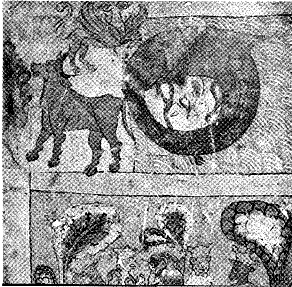
Fig. 5: Behemoth, Leviathan and Ziz and the Blessed , Southern Germany, 1236-1238. Milan, Bibliotheca Ambrosiana, Ms. B 32 inf, fol. 136r

other; Leviathan lives in »the Abyss«, while the Behemoth's territory is located in an invisible desert East of the Garden of Eden (1 Enoch 60:7-8). Controversial information is found in the Jewish apocryphal literature about when these beings were actually created. They are either considered relics of earlier creations or, more frequently, related to the Creation of Man and of the water creatures at the fifth day, and to be eaten at the eschatological banquet. 27 According to the Midrash , Behemoth supposedly keeps the wild beasts (lions, leopards and bears) from the offspring of the more gentle animals nurturing their young. 28