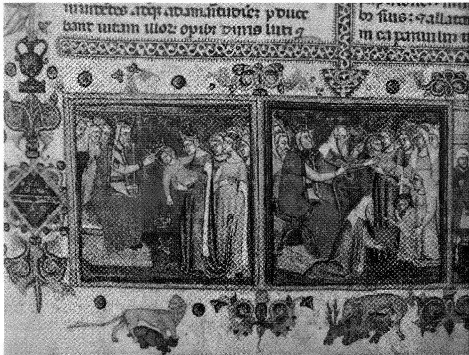
Fig. 2: Bible for Matteo de Planisio , Naples, 1352 or later (?). Vatican, Biblioteca Apostolica Vaticana, Cod. Vat. lat. 3550, fol. 5r

of Jewish legends: »At great costs teachers were invited to come to Egypt from neighboring lands, to educate the child Moses. Some came of their own accord, to instruct him in the sciences and the liberal arts«. 15 If the image of the hammering blacksmith is not a reference to Tubal-cain, it may at least allude to a conversation of Moses and his teachers in the Artes liberales . Petrus Comestor included several other sources and ideas related to the Creation, e.g. the theory about the four elements (most prominent in Maimonides' The Book of Knowledge ). 16 Further arguments integrated in his thoughts about the creation are relating the creation of angels with the creation of light and the spherical disposition of the cosmos borrowed by theories of earlier and contemporary astronomers. Before the first days are described, Petrus Comestor rejects the three main »errors« of Aristotle, Plato and