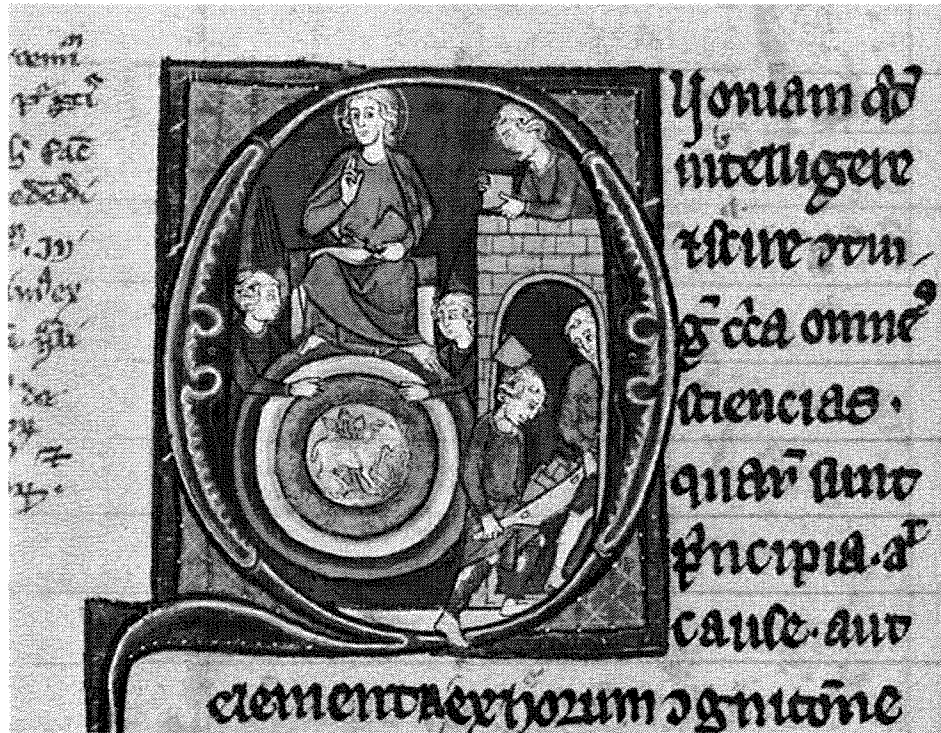
Fig. 4: Creation of the world and of a house/city , Paris, 1260, manuscript with writings by Aristotle and Maimonides. Geneva, Bibliothèque de Genève, Ms. lat. 76, fol. 88r

man and angels are made at the same time. In seeking an answer he draws on the two sources and concludes that the similarity does not include the appearance. 25